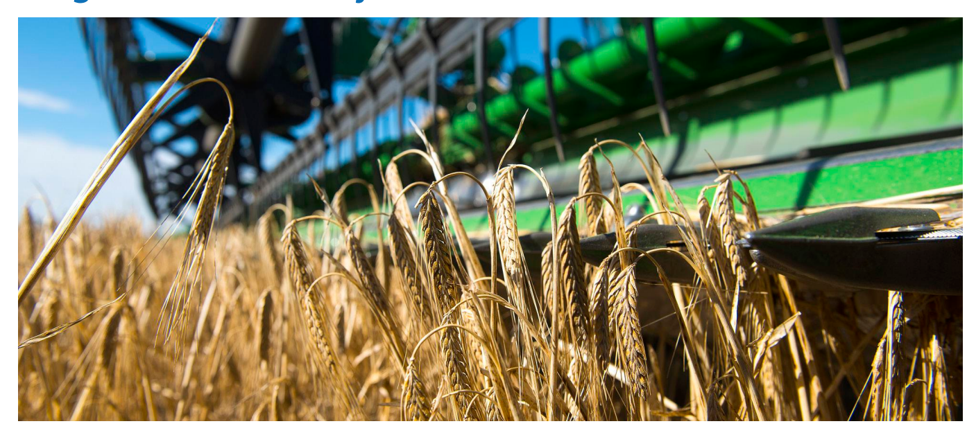
Ukraine in the 2016/2017 marketing year (MY, July-June), according to preliminary data, exported 43.8 million tonnes of grain.